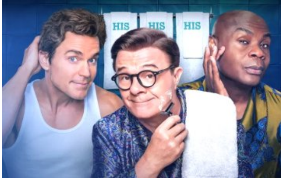
Matt Bomer (Jerry), Nathan Lane (Bunny) & Nathan Lee Graham (Arthur) as the "Golden Gays"

Grace" (David Kohan & Max Mutchnick) put their heads together once again, deciding to follow up on that original inspiration, placing the new series in one of California's gayest sanctuary cities, Palm Springs.