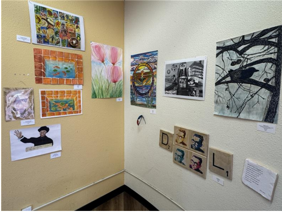
Cohort 2 on display at the art show and reception