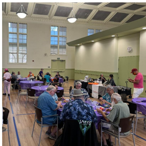
Thank you to everyone that came out to enjoy August's Third Friday Lunch Bunch hosted at the North Oakland Senior Center.