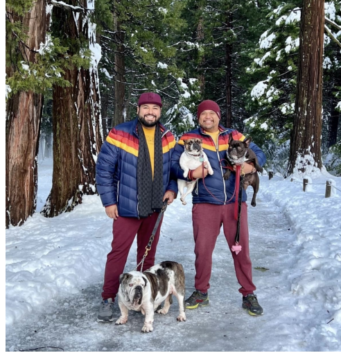
Christmas in Yosemite, December 2022