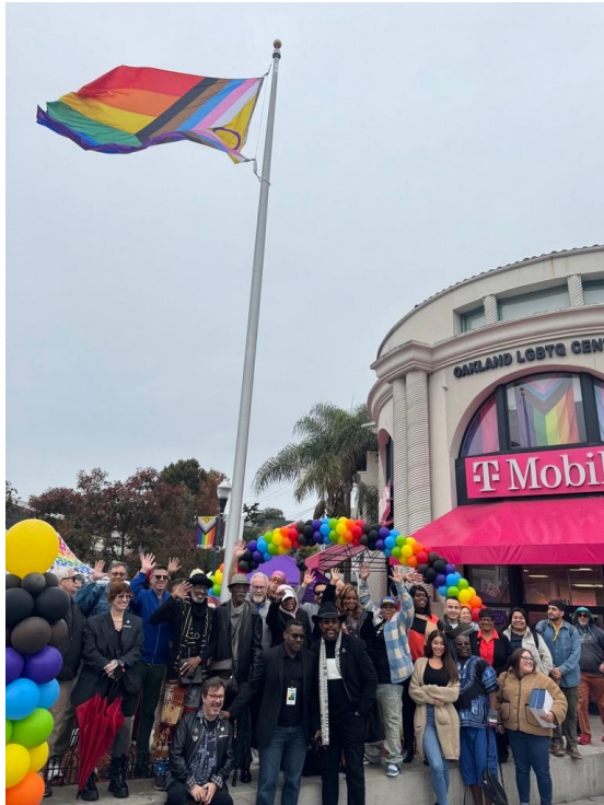
A large crowd, including many Lavender Seniors members, gathered in front of The Oakland LGBTQ Community Center for the Lakeshore LGBTQ Cultural District's flag raising ceremony

Please click here to donate and support our seniors.