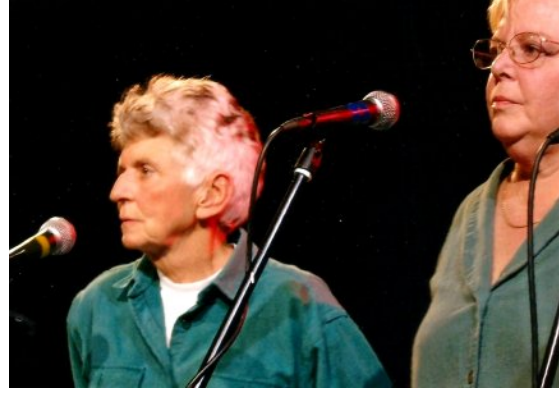
Singing with "Out on a Clef"