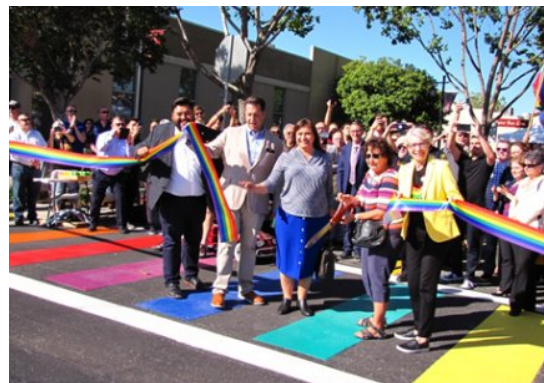
The San Leandro City Council Members cut the ribbon