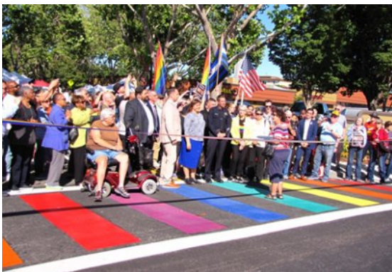
The crowd gathers for the crosswalk ribbon-cutting

The ribbon-cutting for San Leandro's rainbow crosswalk in downtown San Leandro, at Parrott Street and Washington Avenue, took place on the 19th June. A crowd gathered for the inauguration of this symbol of LGBTQ celebration in the city.