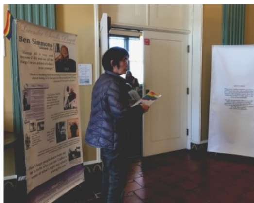
Lavender Scrolls on Display at Emeryville Senior Center