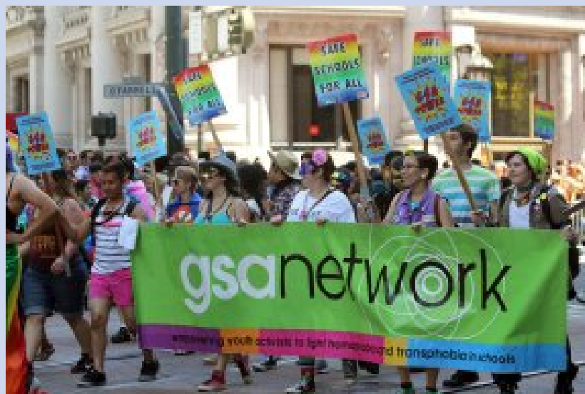
GSA Network at Pride 2013

In the late 1980s, two high-school groups – called Gay-Straight Alliances – were formed in Massachusetts (Concord Academy and Phillips Academy) bringing students who identify as lesbian, gay, bisexual or transgender together with “straight” allies, who could help defend them against discrimination and abuse – to provide a safe place for people to speak about that which dare not speak its name a generation earlier. Within two decades, there were GSAs developed in over 1,000 schools in 40+ states.