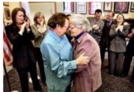
Elderly Gay Male Couples Face End-of-Life Decisions LGBT heroes Del Martin and Phyllis Lyon (Kamala Harris to left) had to face End-of-Life Decisions during their 56 years together

After holding our December meeting at Harry's Hofbrau, we are returning to our usual location on Saturday, 13th January, at All Saints Episcopal Church, 911 Dowling, San Leandro, where buffet lunch will be presented at 12 noon. After announcements at about 12:40pm, our speaker will make his presentation for a half-hour or so, after which there will be ample time to ask all of those insurance-related questions you might have. Please join us!