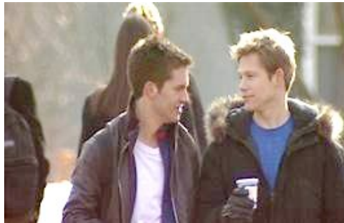
The Senator's closeted gay son hooking up with an ACT-UP Activist on Campus

Comparisons with the politics of sexuality in the context of current divisiveness will be inevitable to viewers. Though marriage equality has become the law of the land, DOMA and "Don't Ask, Don't Tell" have been repealed, there are still powerful conservative forces in the country that are moving "religious freedom" legislation through state houses across the land, trying to step back the progress made for LGBTQ Americans since Stonewall.